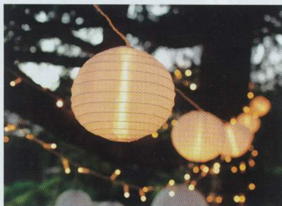
Lunar Fairy Light lanterns, £19.99 for 10 lanterns on four metres of clear cable, Lights4Fun