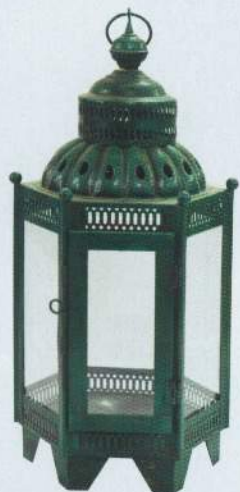
Green metal lantern, £55, Ibbi

Long, balmy summer nights offer the perfect excuse to sit in the garden, whether for a simple aperitif or a relaxed dinner with friends and family. Cast a gentle glow with elegant paper-lantern-style lights strung delicately amidst overhead branches, adding a warm ambience at ground level with candles in metal lanterns. Opt for hues of blue and green to set the scene and chime with natural surroundings.