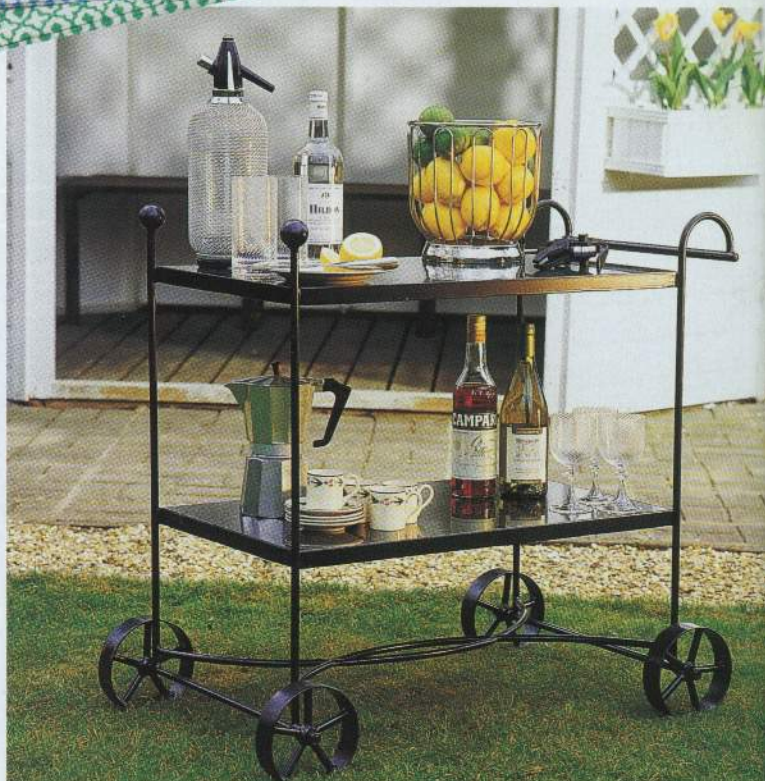
Trolley finished in black with Verde Butterfly granite shelves, £1,860, The Heveningham Collection