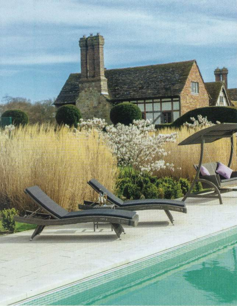
ABOVE Charcoal and mid-grey tones have a sleek, contemporary appeal. Monte Carlo adjustable sunbeds, around £499 each, Alexander Rose