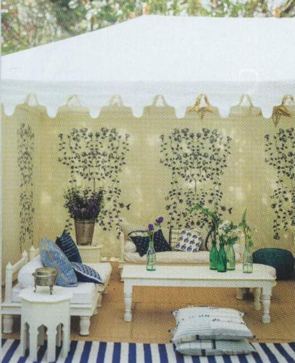
Raj Tent, from £2,400, and all accessories, Raj Tent Club