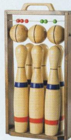
Skittles Set, £95, The Conran Shop