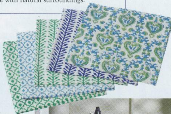
Best block-printed napkins, £20 for a pack of five, Ibbi