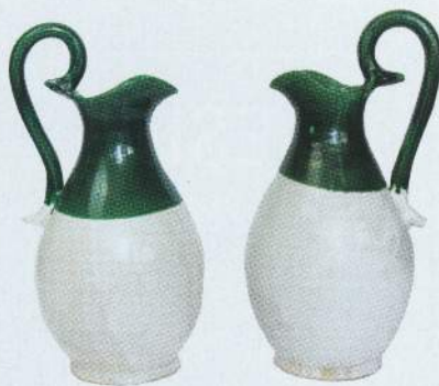
Handmade large green-and-white ceramic glazed jugs, £144 each, Irving & Morrison at Lorfords London