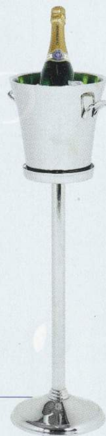
Eichholtz Standard 5663 wine cooler on stand, £259, Houseology